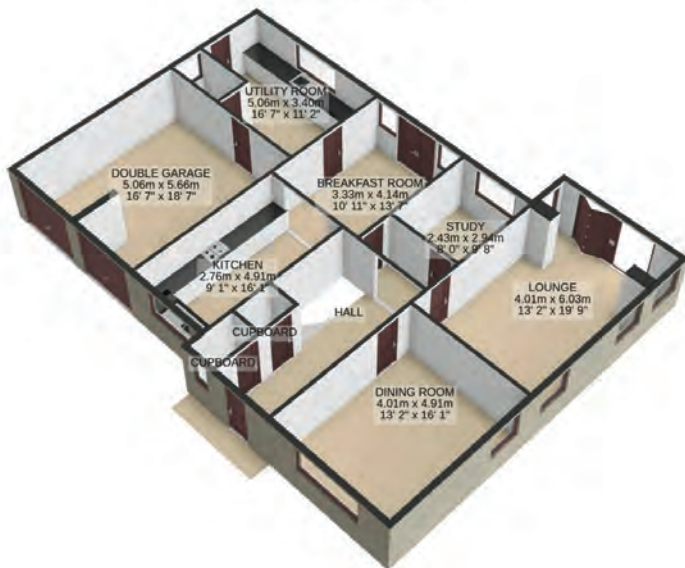
Ground floor 142.1 sq.m. (1530 sq.ft.) approx.