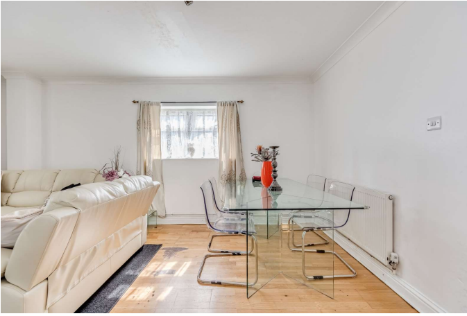
Living Room/Dining Room 17'5" x 12'3" (5.3m x 3.73m)