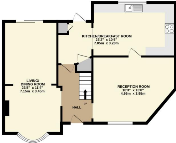
GROUND FLOOR 737 sq.ft. (68.5 sq.m.) approx.