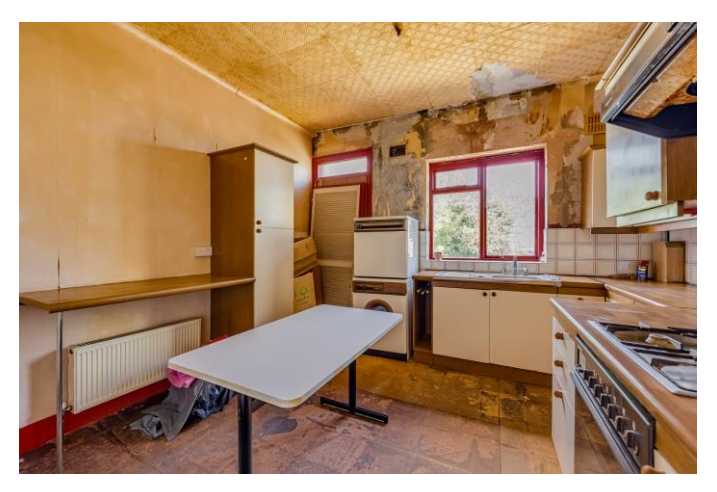
Kitchen 13'5" x 12'6" (4.1m x 3.8m)